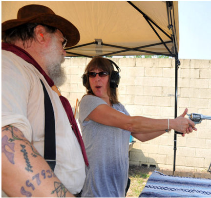
A fun filled day.